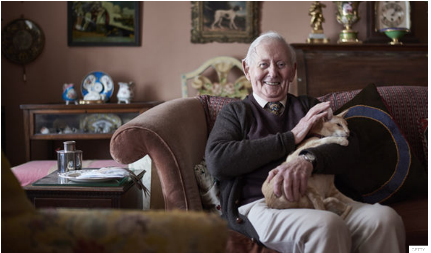
Cats and dogs could TALK to owners with technology in coming years, experts say

Voice activation and artificial intelligence products will surge, it is believed while fitness trackers will become so small they could be IMPLANTED in bodies.