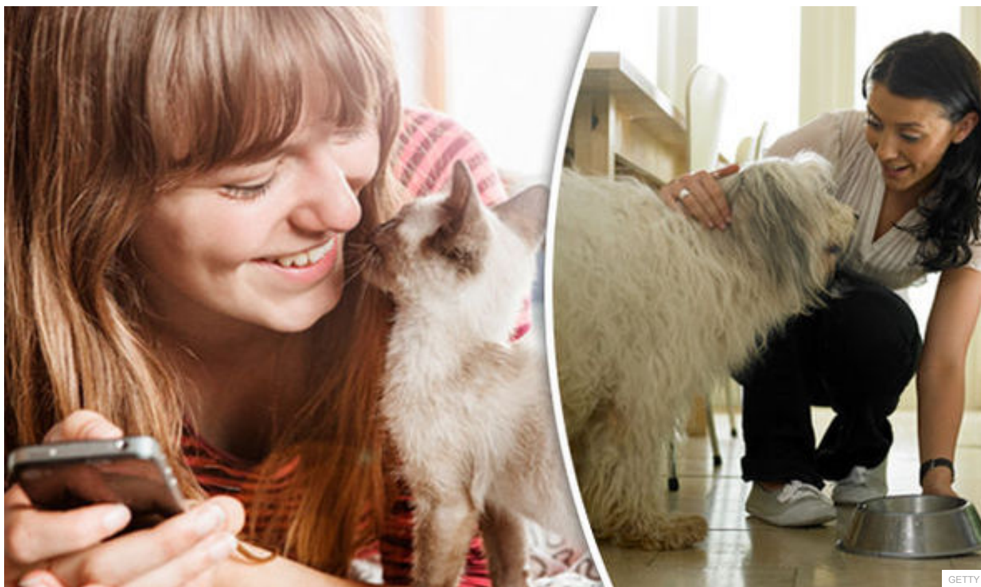
Talking dogs? Technology advances to aid communication with pets

IT is the invention every pet lover has been waiting for - and Amazon claims it is on the way - technology which will help you TALK to your dog.