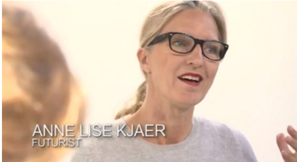
VIDEO: GENERATION IP:2025 Virgin Media Roundtable