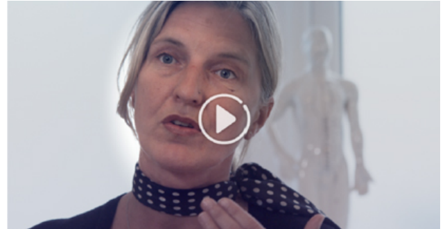
VIDEO: 2020 SHAPING IDEAS Ericsson