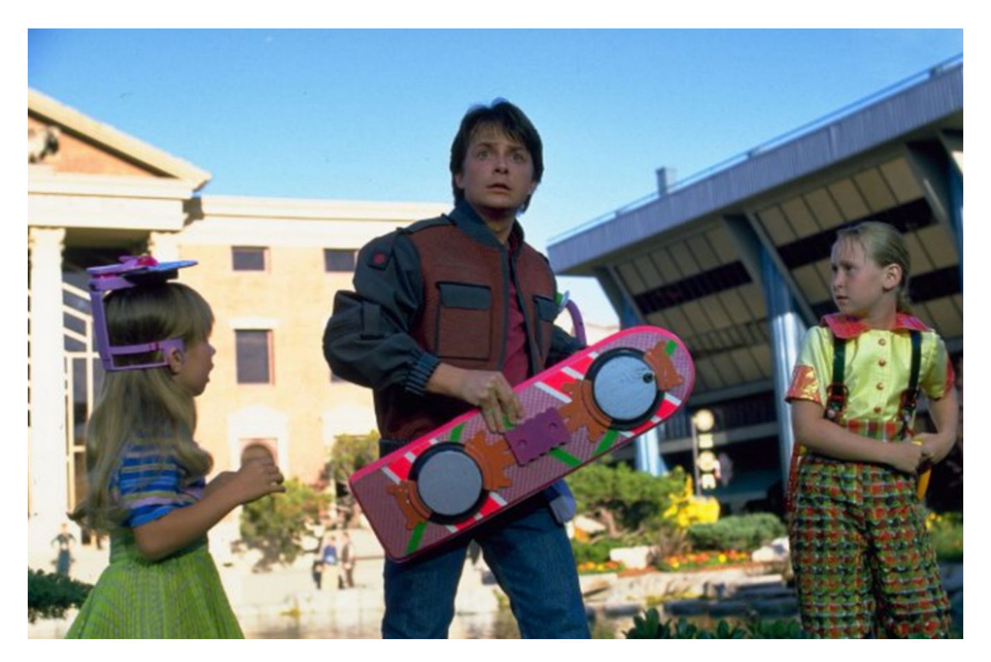
Amblin Entertainment/Universal Pictures