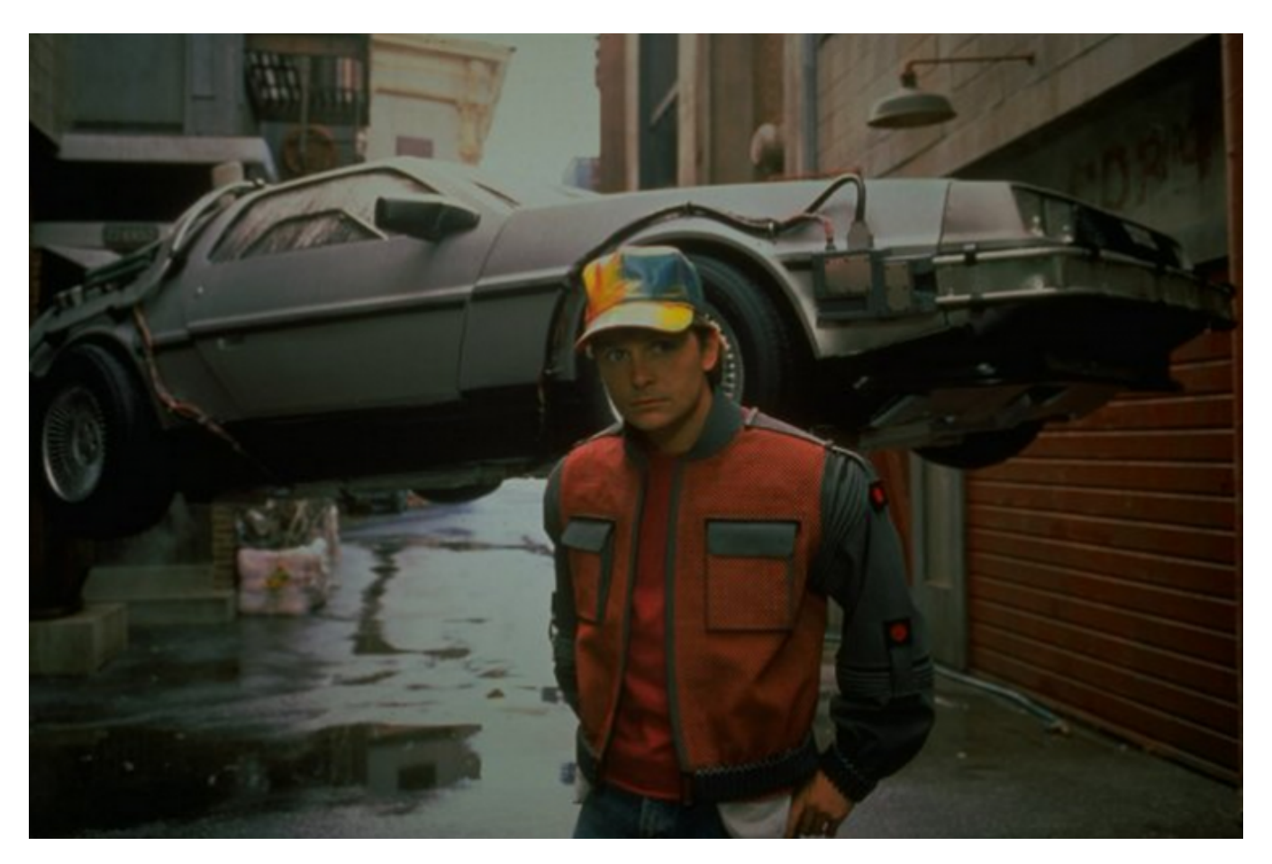
Amblin Entertainment/Universal Pictures