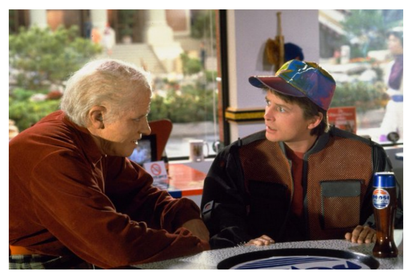
Amblin Entertainment/Universal Pictures